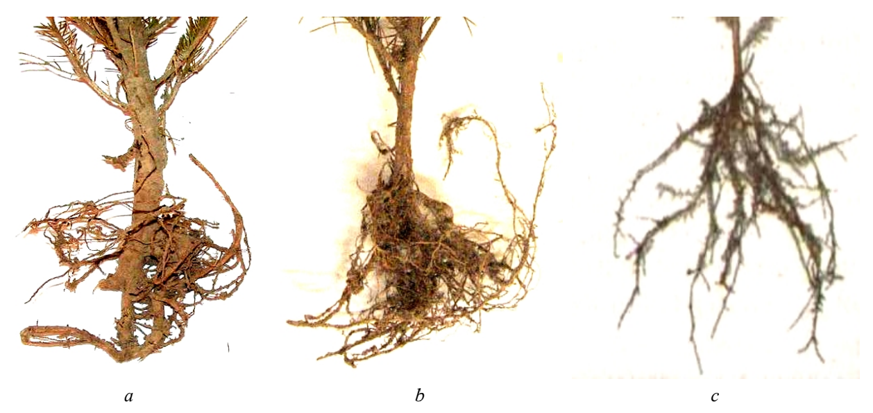
a, b – using para-plough; c – using planting machine L-218 Fig. 2. Development of root system of Norway spruce transplants