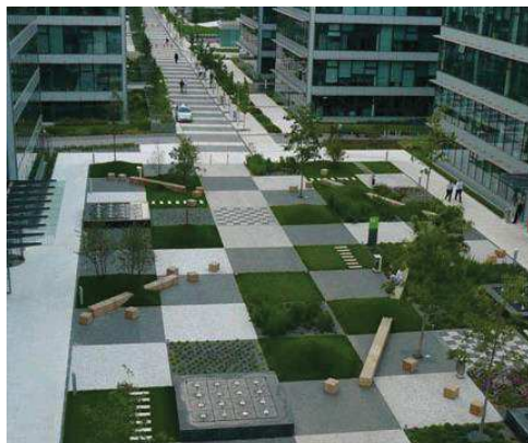
Fig. 2. “Checkerboard” square

The Belarusian capital ahead of many major European cities according to this criterion a comfortable stay. However, you should pay attention to the problem in the cities, especially killing existing green areas and gardens and construction in their place, shopping centers, banks, apartment buildings etc. With new objects in a priori, does not provide for the creation on its territory of green zones, planting of trees or shrubs – ignoring the landscape design, “green areas” eco-design in modern Belarus. If used for the construction of commercial and industrial centers of environmentally friendly building materials are too expensive and therefore impractical, the complete disregard for the green areas – unacceptable.